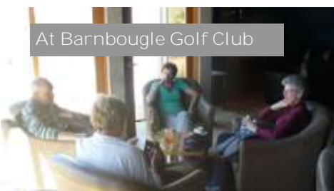
At Barnbougle Golf Club