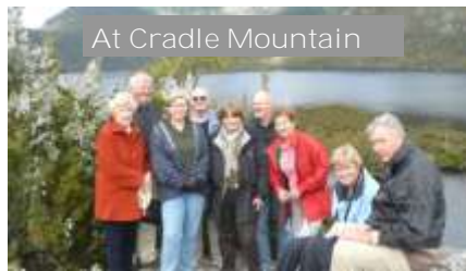
At Cradle Mountain