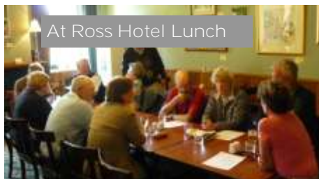
At Ross Hotel Lunch