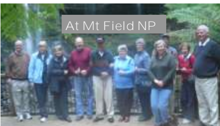
At Mt Field NP