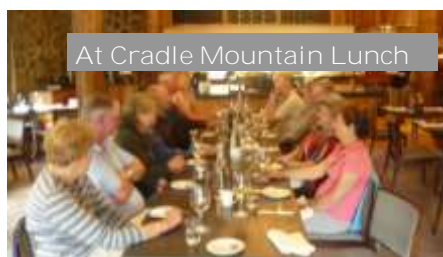
At Cradle Mountain Lunch

A lot of eating was a feature of the Pre Conference Tour.