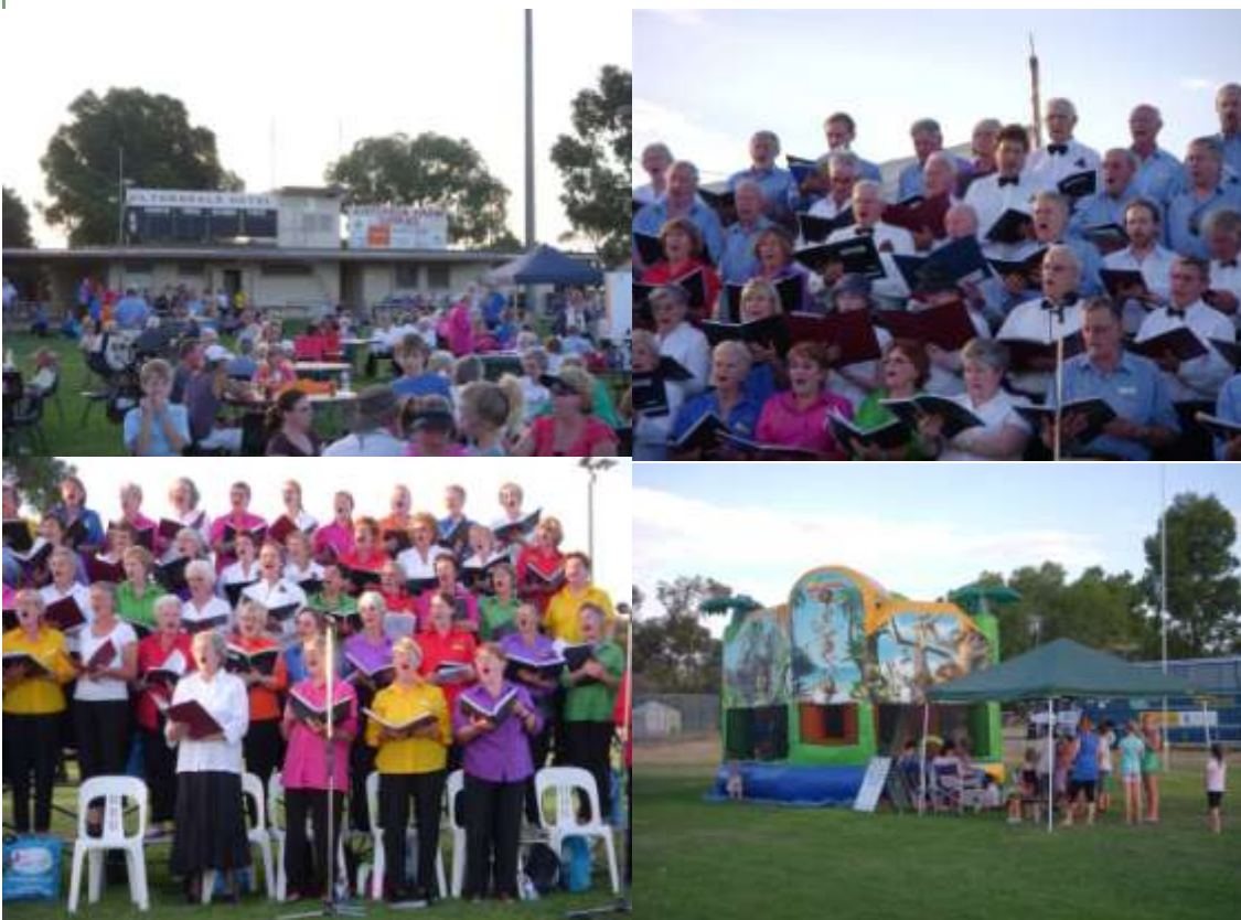
Photos From Evening With The Stars Katunga