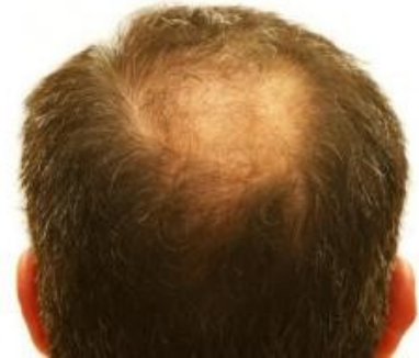
Researchers have discovered the

The work was funded by the National Institutes of Health and the Connecticut Stem Cell Research Program. ◆